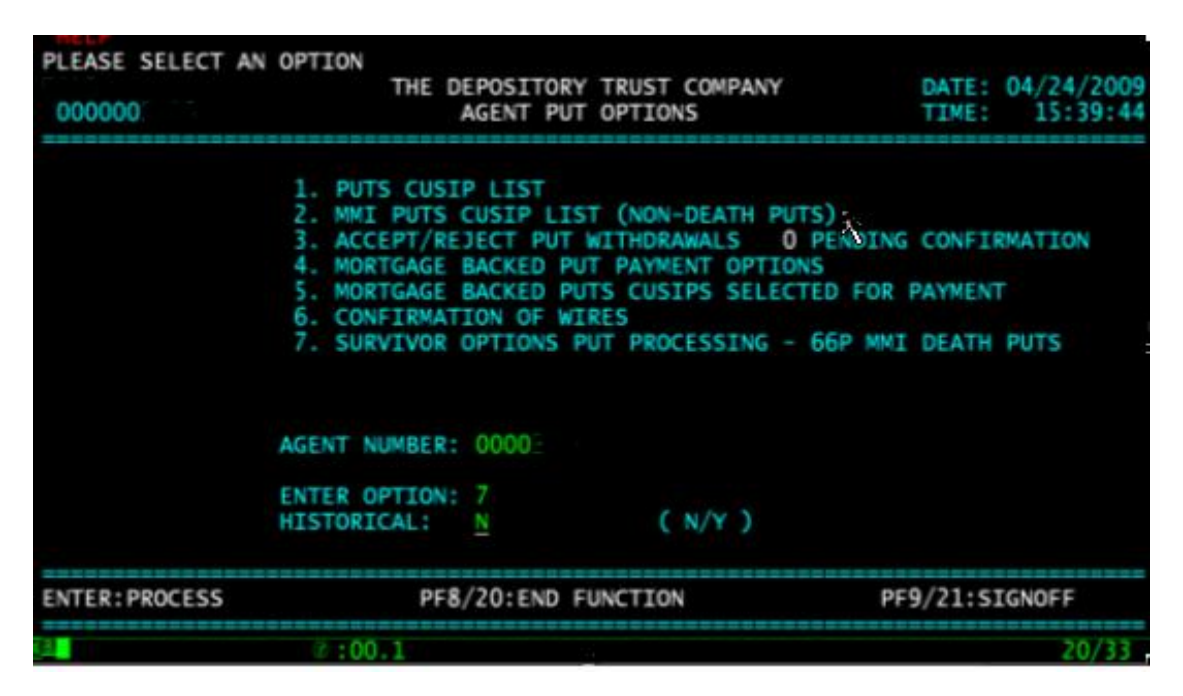
FIGURE 1, AGENT PUT OPTIONS MENU