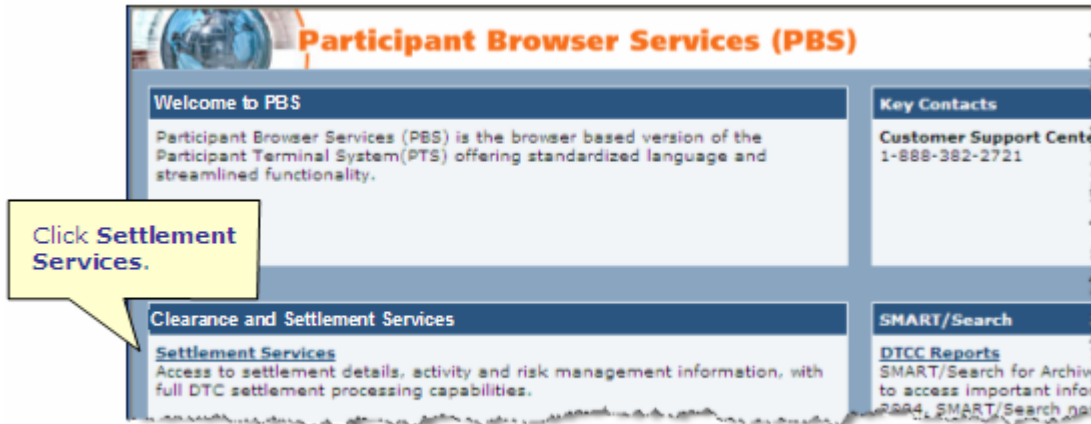
PBS Home page

The Welcome to Settlement Services page appears.