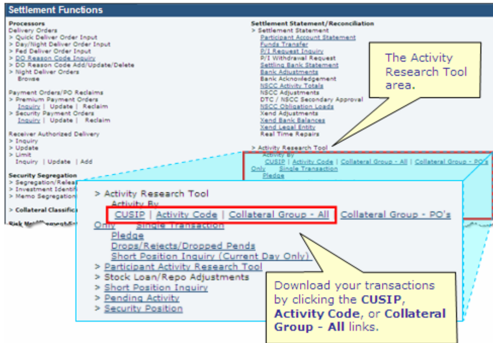
Activity Research Tool area on the Welcome to Settlement Services page